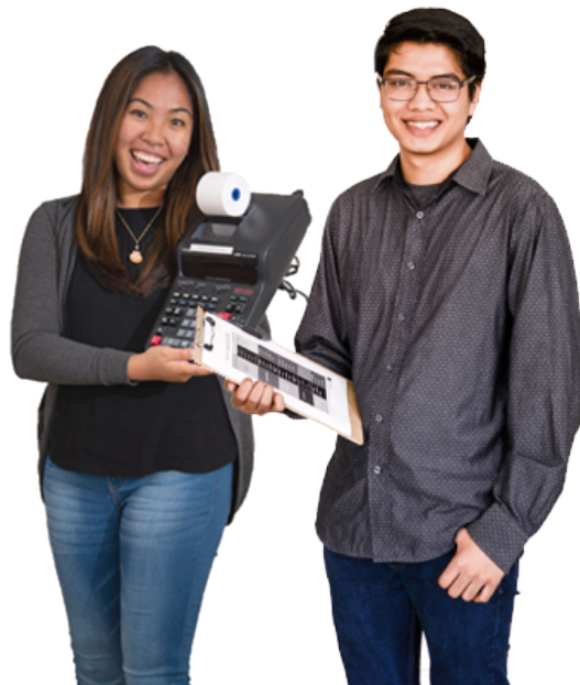
Isa Accounting Program

For any questions, please contact the Financial Aid Office at 808-245-8360.