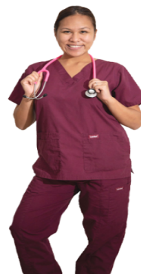
Tahra Medical Assistant Program

The College has five academic divisions: Business Education; Health Education; Language, Arts, and Humanities; Science and Mathematics; and Trade Technology. The College also offers non-credit courses through the Office of Continuing Education and Training and access to advanced degrees through the University Center.