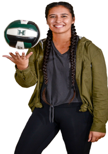
Brittany Health Sciences Program