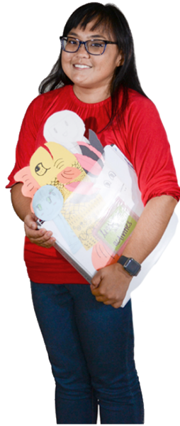
Traci Early Childhood Education Program