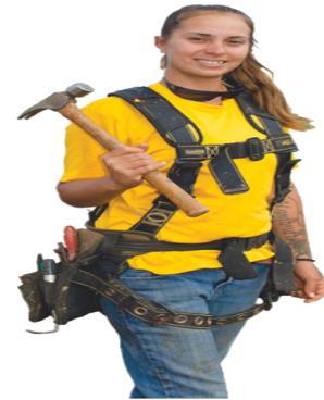
Michal Carpentry Program