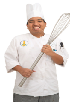
Armin Culinary Program