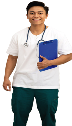
Melvin Nursing Program