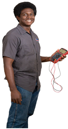
Carlthron Automotive Program