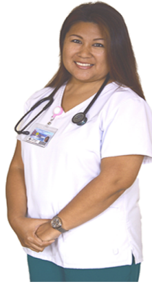
Tricia Nursing Program