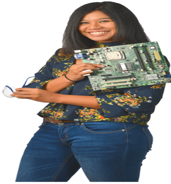
Ying Electronics Program