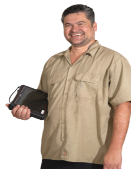
Dominik Automotive Program