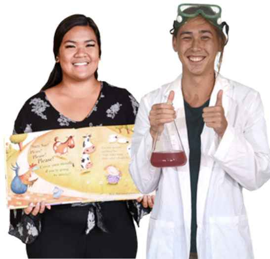
Judy Anne Early Childhood Education Program

For any questions, please contact the Financial Aid Office at 808-245-8360.