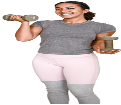
Moriela Health Sciences Program