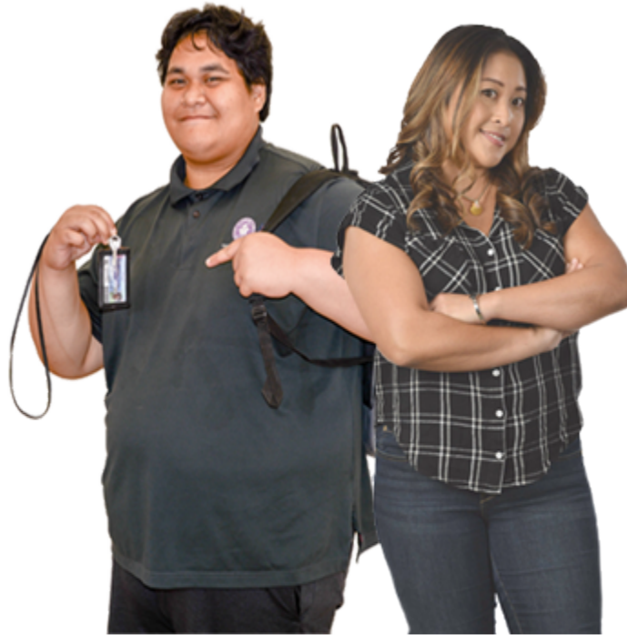
Keiki Hawaiian Studies Program

Since many classes do not have mandatory attendance, it is still the responsibility of any student who registers for class but then desires not to attend or participate to drop any unwanted classes during the 100% refund period to avoid financial and academic penalties. A student who is administratively withdrawn from a course may request a reinstatement through the instructor and the Vice Chancellor for Academic Affairs. Late fees may be applicable and reinstated students are responsible for missed work and assignments. The Student Participation Verification in Coursework policy can be viewed at https://www.hawaii.edu/policy/index.php?action=viewPolicy&policySection=ep&policyChapter=7&policyNumber=209 .