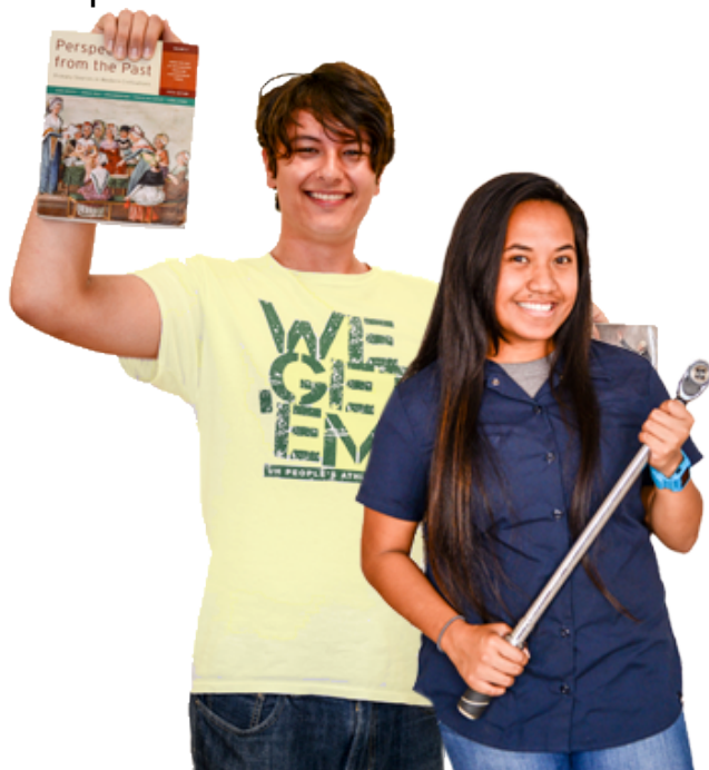
Brad Liberal Arts Program