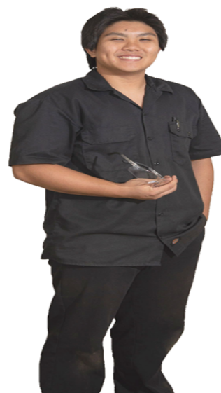
Dane Automotive Program

or arkauai@hawaii.edu for more information.