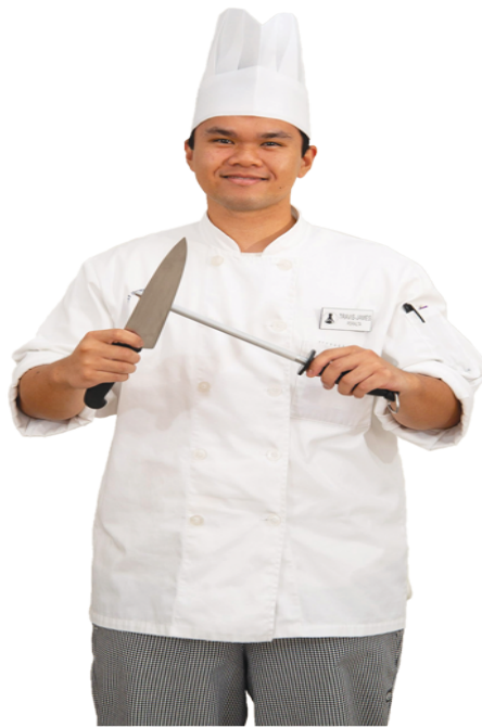
Travis Culinary Arts Program