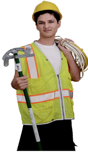
Stetson Electrical Program