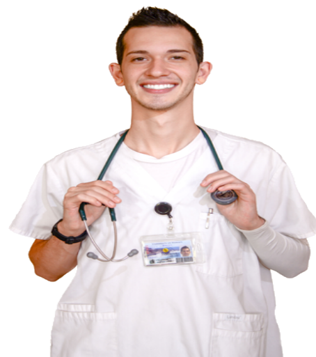
Andres Nursing Program