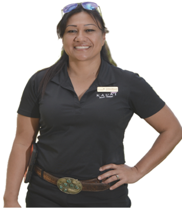
Tristol Hospitality Program