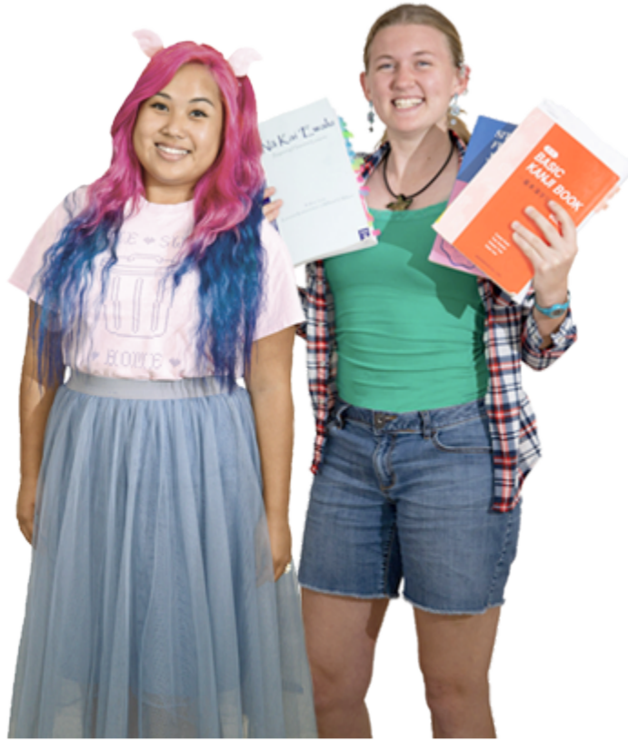
Marley Liberal Arts Program