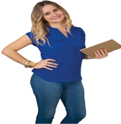
Bonnie Creative Media Program