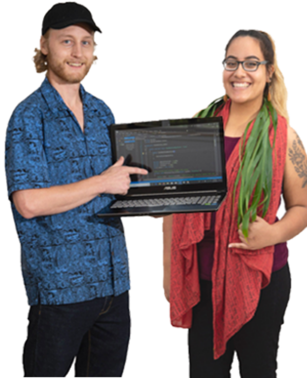
Nick Electronics Program

For assistance, please contact the ITS Help Desk .