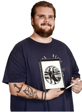
Travis Creative Media Program