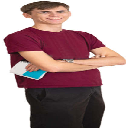
Beorn Hospitality Program

Kaua'i Community College has agreements with the following colleges, universities, and institutions to promote international exchange: