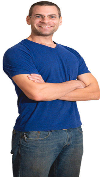
Sterling Electronics Program