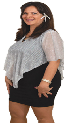
Jasmine Hospitality and Tourism Program