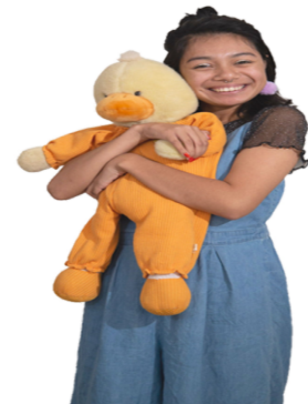
Johanna Early Childhood Education Program