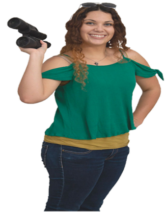
Heather Natural Science Program

Lists of directory information will not be made publicly available to third parties.