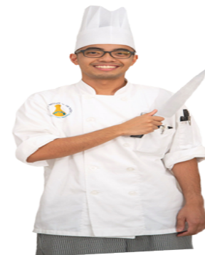
Jae Culinary Program