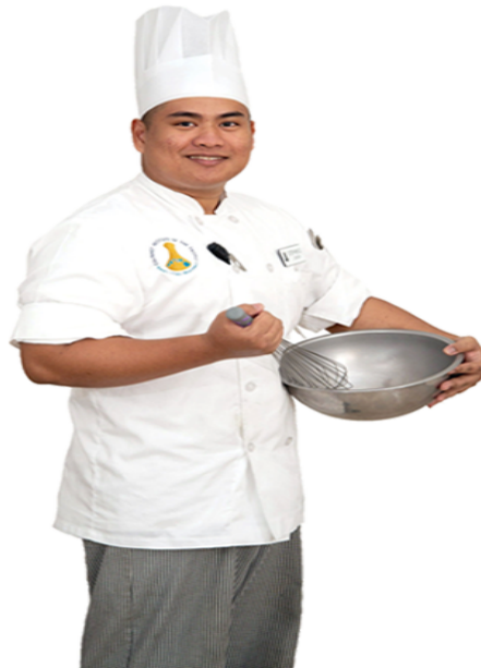
Stephen Culinary Arts Program