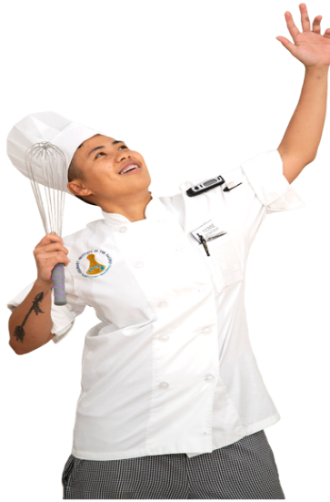
Yvonne Culinary Arts Program