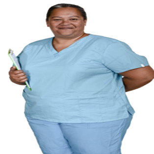
Melanie Nursing Program