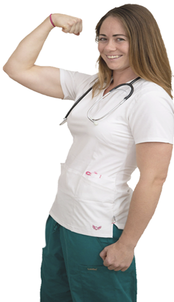
Shale Nursing Program